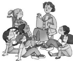
Children's Mass in our Parish